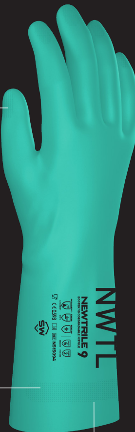
Flock-lined inner surface for comfortable wear