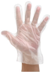
White Single-Use Thermoplastic Elastomer (TPE) Gloves