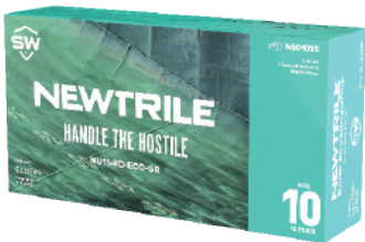
NewTrile® NU11-RD-ECO-GR 11 mil Unlined Nitrile Chemical-Resistant Gloves with EcoTek®