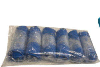
CoreSafe® PC-F22B Natural Rubber Chemical-Resistant Gloves Flock-Lined